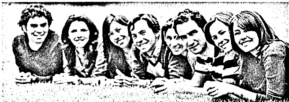
The young wishing to study abroad will get ample information at this fair

Some leading UK universities attending are Cardiff, Lancaster, Nottingham Trent, Anglia Ruskin, Birmingham City. From the USA there are - Valparaiso, University of Massachusetts (Boston), University of Massachusetts (Dartmouth), University of Massachusetts (Lowell) and Western Kentucky University; Canada - Centennial College, Thompson Rivers University, Humber College, George Brown, Conestoga, Algonquin; Australia - Newcastle, Curtin University, Bond University, Macquarie, Sydney Institute of Business & Tech-